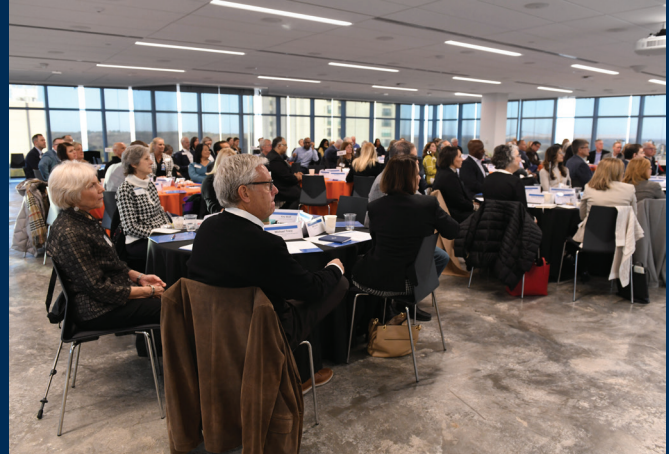
Fall Meeting, Ad Astra Room, KU Medical Center Campus

Thank you for your work to enhance and promote the reputation of the KU Academic Medical Center over the past year! In the 2023-2024 board year, Advancement Board members hosted events, made generous contributions, attended programs to learn about the work of our academic medical center, and helped launch the public phase of KU's Ever Onward campaign. This $2.5 billion campaign is the largest and most comprehensive in the history of the University of Kansas, KU Athletics, and The University of Kansas Health System. We look forward to continuing our good work together through the campaign's successful conclusion in 2028, and well beyond.