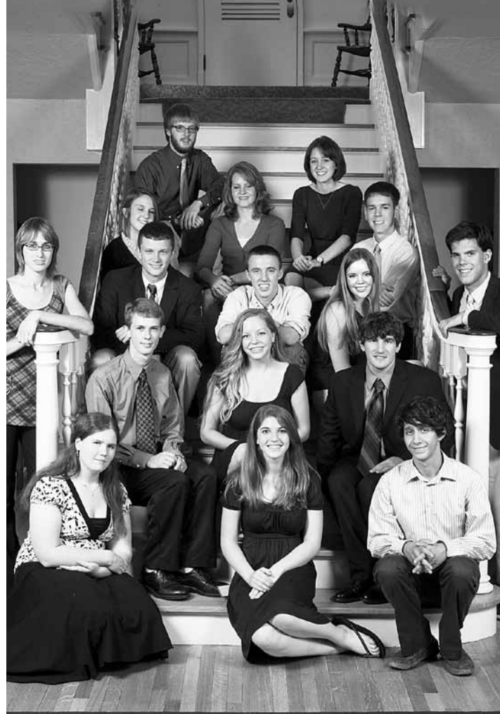
Chancellors Club Scholars